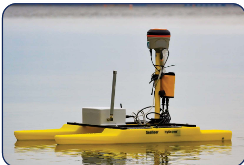
Unit can be integrated into remote / autonomous vessels

The HydroLite-TM™ should be included in every hydrographic survey equipment kit. Developed to meet requirements for the U.S. Army Tactical Dive Teams, the rugged, wireless HydroLite-TM™ looks and feels like your traditional survey instrument. It quickly measures and logs depths more accurately than standard systems, making fast work of ponds, rivers, lakes, and more.