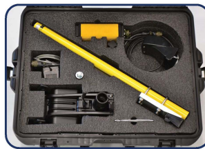
Rugged Shipping Case