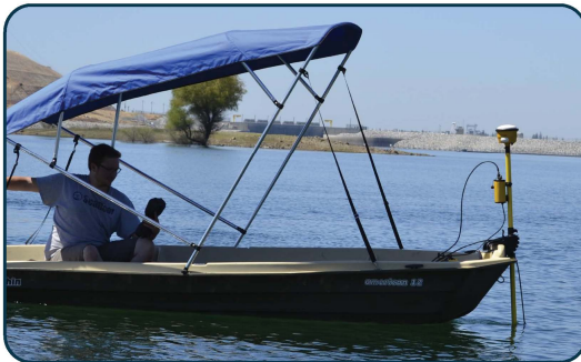
HydroLite-TM Mounted to jon boat bow